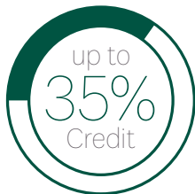
of Premiums Non-Profit Businesses

The maximum tax credit available is 50 percent of premium expenses as a for-profit employer. The maximum credit for tax-exempt employers is 35 percent. This credit applies to two consecutive tax years.* Small businesses must purchase health insurance through CCSB to be eligible for the tax credits offered.