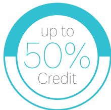
of Premiums For-Profit Businesses

The amount of credit you are eligible to receive works on a sliding scale. The smaller your business and/or the lower your annual average wage, the larger your credit will be.