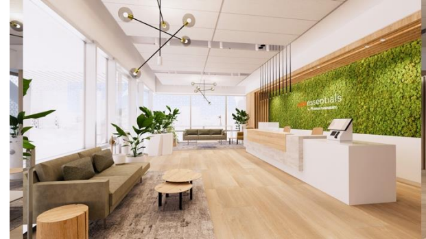
Care Essentials in the heart of downtown San Francisco.

Located at the Salesforce Transit Center to meet members where they are, this innovative new facility offers extended hours. Services include same-day appointments, pharmacy, lab tests, vaccines, injections, and treatment of minor illnesses and injuries.