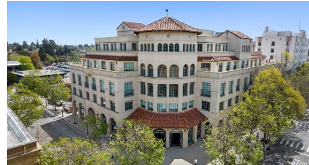
At the new Santa Cruz Medical Offices, members have access to family medicine, lab, mammography, ob-gyn, pediatric, pharmacy, and X-ray services.