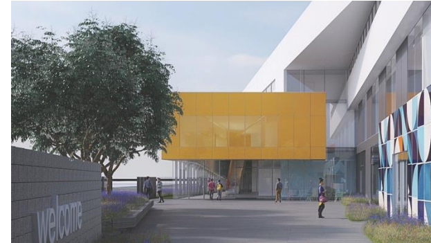
Watts Medical Offices and remodeled Watts Counseling and Learning Center