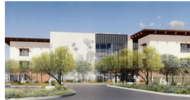
Wildomar Trail Medical Offices